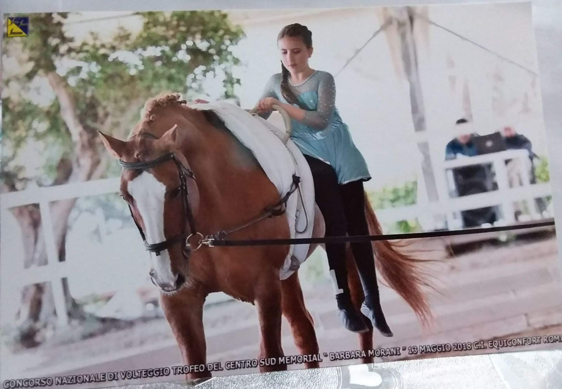
CONCORSO NAZIONALE DI VOLTEGGIO TROFEO DEL CENTRO SUD MEMORIAL "BARBARA MORANI" 13 MAGGIO 2018 C.I. EQUICONFORT ROMA